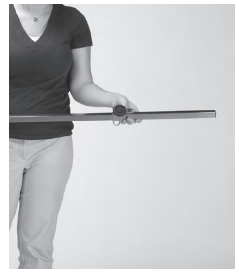
12). Re-attach the fastener you took off of the Major Grooming Arm (E) and tighten it to secure it to the end of the arm. Ensure that the fasteners with grooming loop holders have the loop holders pointing downwards for easy loop attachment.