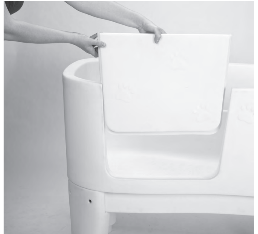
15). Slide the Door (L) into the groove on the Base (B) to secure it.