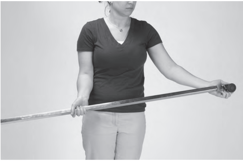
10). Place the Support Grooming Arms (C), Subsidiary Grooming Arm (D) and Major Grooming Arm (E). The Major Grooming Arm (E) has two fasteners – one on either end. Loosen one of the fasteners and slide it off the Major Grooming Arm (E).