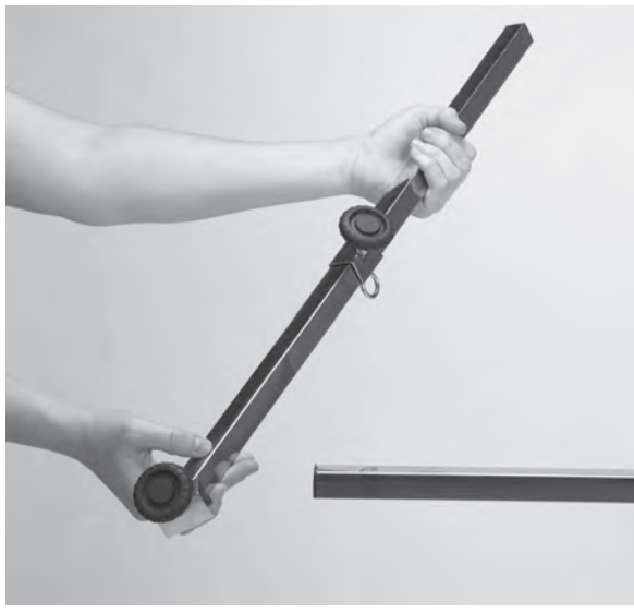
11). Find the Subsidiary Grooming Arm (D) and slide it onto the Major Grooming Arm (E). Slide it to the middle of the Major Grooming Arm (E) and then secure it by tightening the fastener.