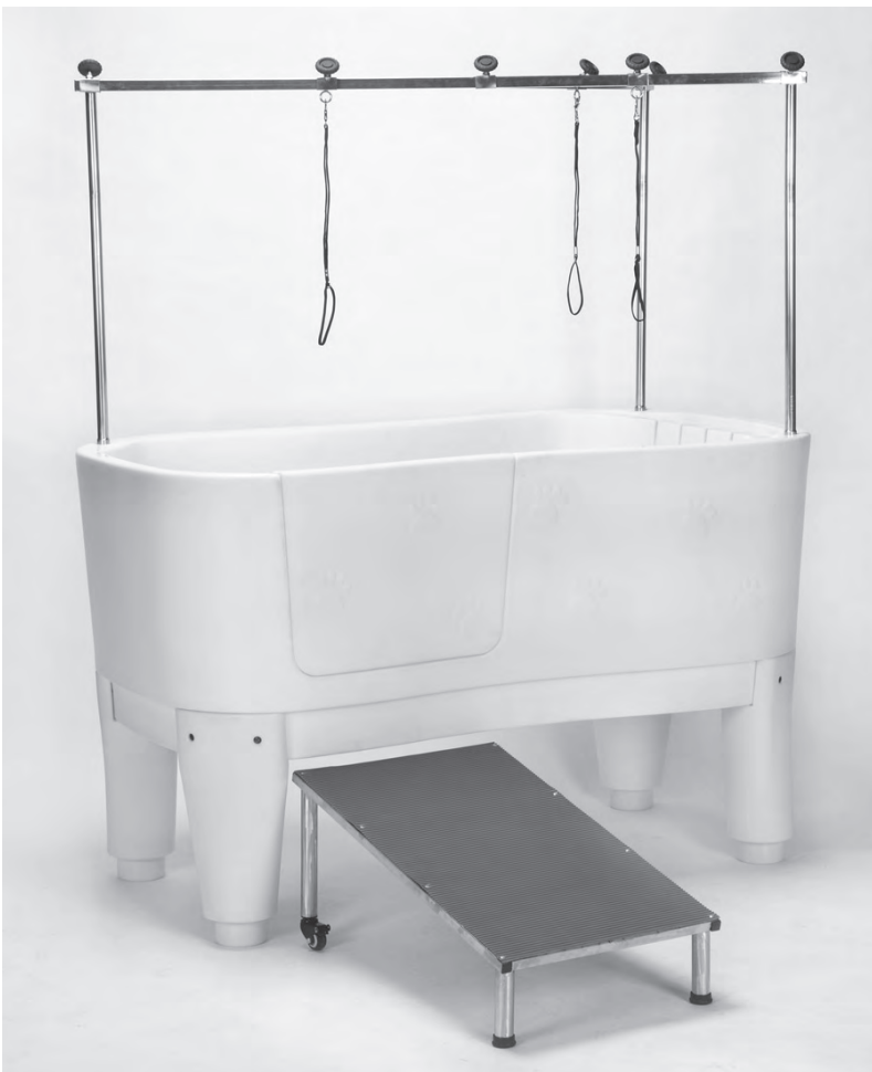
16). Fully assembled with Ramp (N).