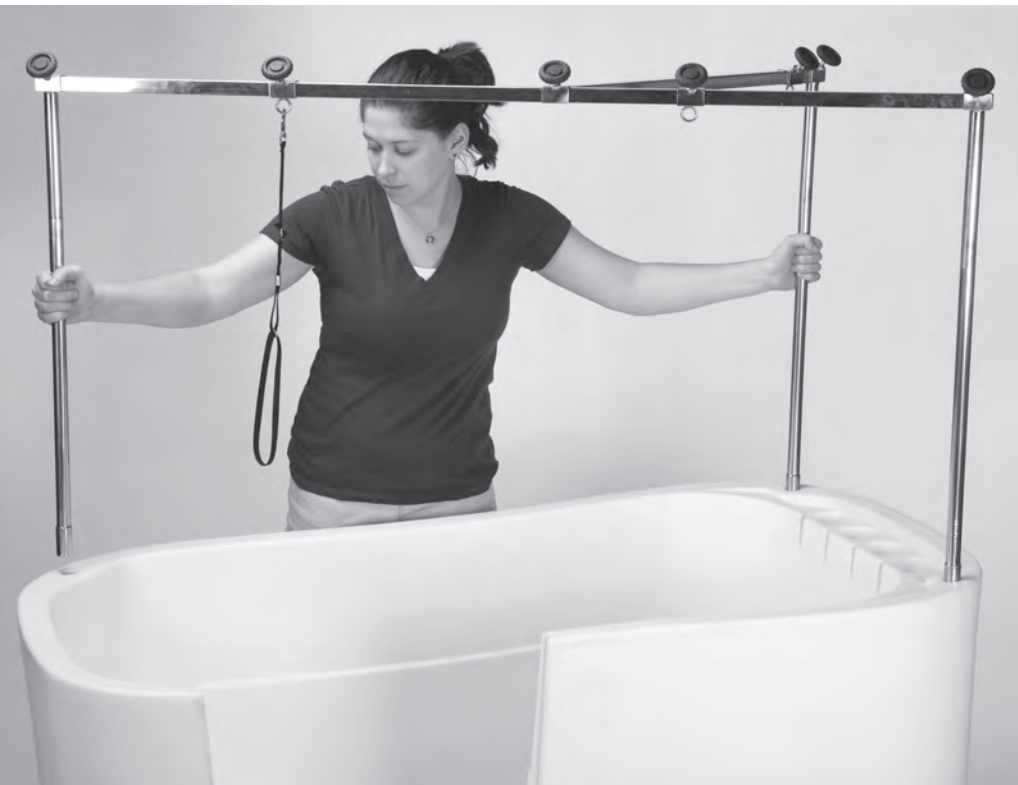
14). Lift the grooming arm structure and fit the base of each of the Support Grooming Arms (C) into the three arm holes on the top of the tub base.