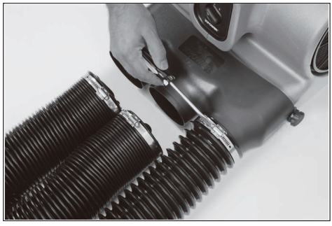
Attach each Hose (B) to the Blower Fan Adapter (A) using the Hose Clamps (D). Tighten Hose Clamps (D) with a flat head screwdriver (not included).

1) Clamp Blower Fan Adapter (A) to front of the dryer. Make sure screws on the side of the Blower Fan Adapter are securely locked.