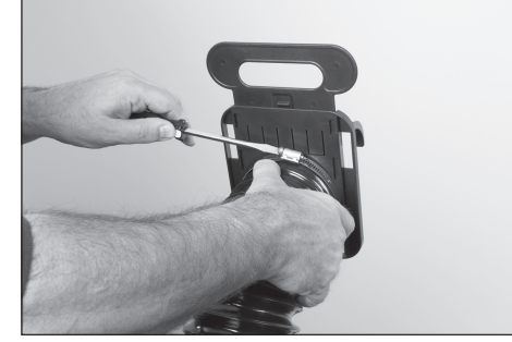
3) At the other end of each Hose (B), attach the Airflow Adjustment Doors (C) using the remaining Hose Clamps (D).